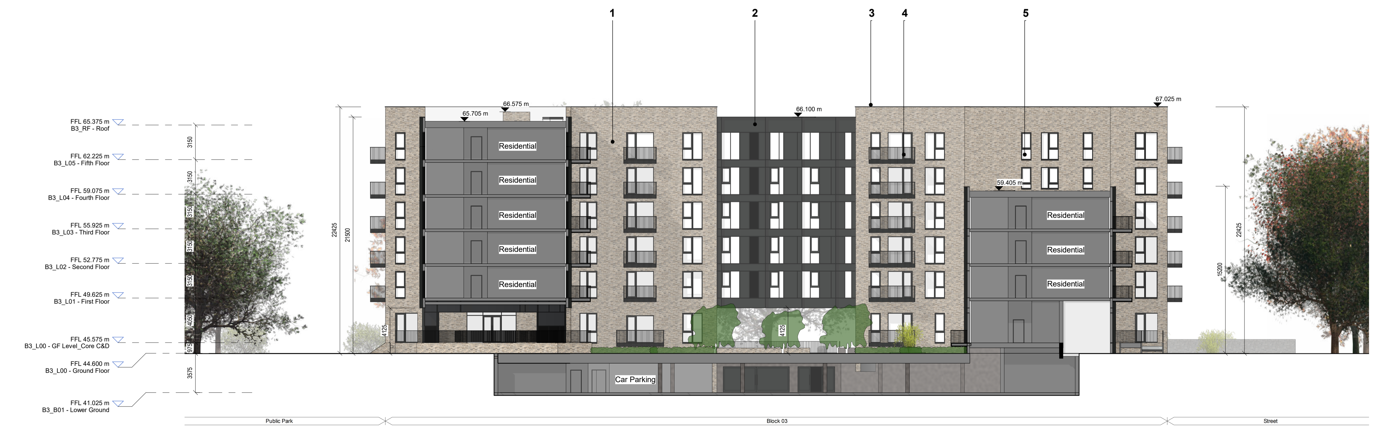
West Courtyard Elevation 1 : 200

Notes: - Do not scale from this drawing. Use figured dimensions in all cases. - Verify dimensions on site and report any discrepancies to the Architect immediately. - This drawing is to be read in conjunction with the Architect's Specification. - © This drawing is copyright and may only be reproduced with the Architect's permission.