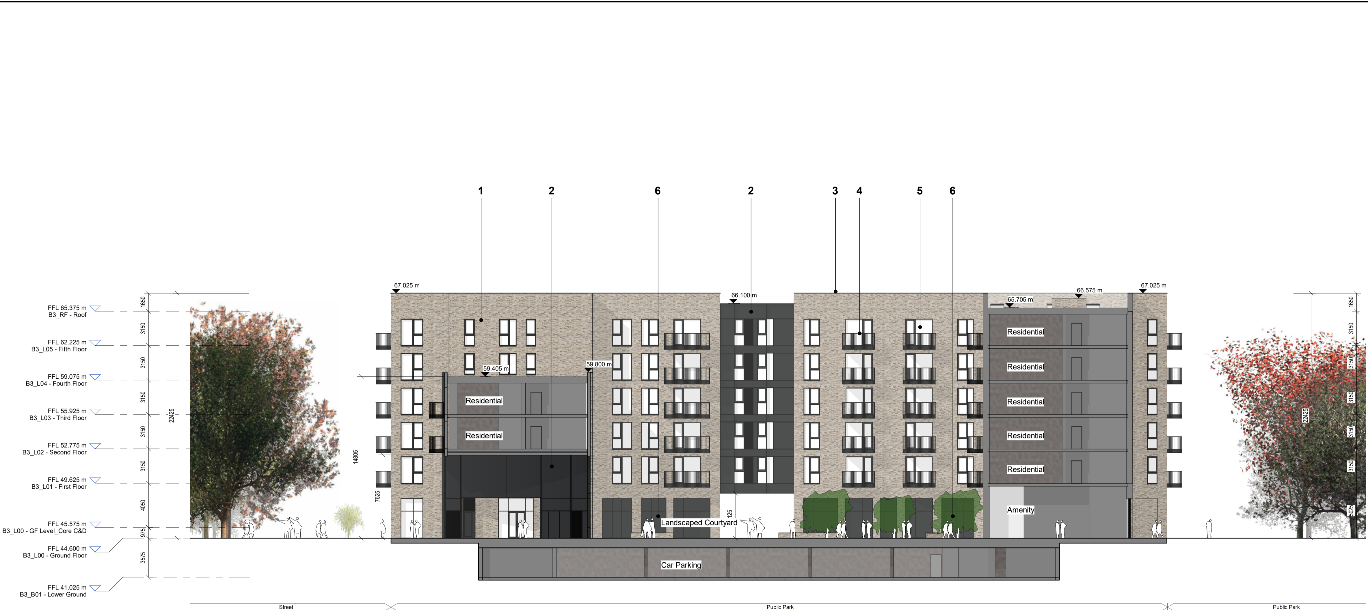
East Courtyard Elevation 1 : 200